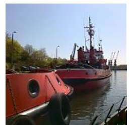
"TAURUS" the tug.