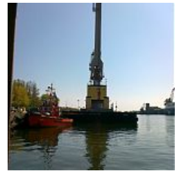
The crane boat.