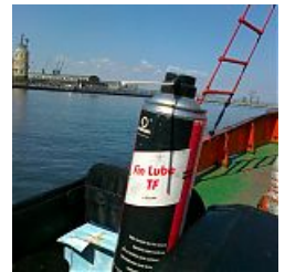
A presentation of Fin Lube TF on a vessel.