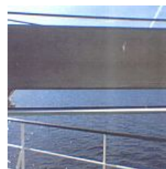
After lubrication with Interflon Grease LS1.