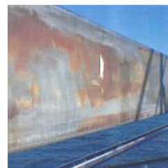
Corrosion on the crane mast.

TEL. (31) 165 55 39 11 / FAX (31) 165 53 80 82